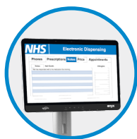
Infinity all-in-one PC