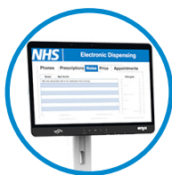
Infinity all-in-one PC