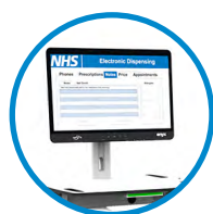
Infinity all-in-one PC