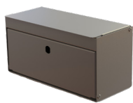
External return bin